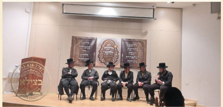
שבת התרוממות דקדושה